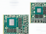
MXM GPU Modules