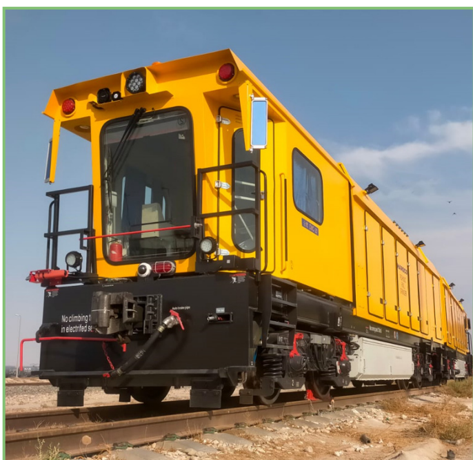
Harsco Rail Transit Switch Grinder (20 stone)

HARSCO RAIL Enabling TECHNOLOGY IN MOTION