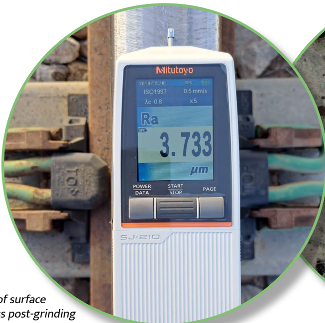
Reading of surface roughness post-grinding