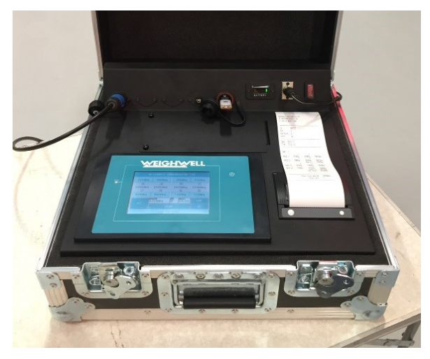
*The PTW is not trade approved and specifications subject to change.

Weighing information on the individual wheel, axle, bogie and railcar can either be printed out or exported multiple times via the use of a USB stick into a .csv file.