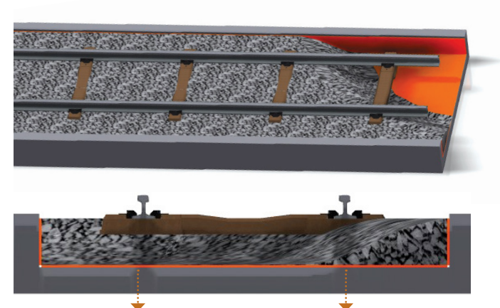
Leniter Ballast Mat shown in orange

An under-ballast solution, Trelleborg's Leniter Ballast Mat system is installed directly under the ballast, providing vibration isolation and protection to the track components. The system extends the period of track availibility between rail tamping scheduled maintenance, alongside delivering the environmental benefit of reduced disturbance, through a reduction in local noise pollution.