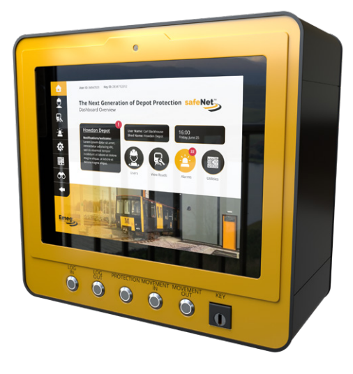
New safeNet™ HMI control panel

Emeg Group's core engineering staff have been pioneers in developing innovative DPS products for over 40 years, starting with the design and installation of the very first DPS