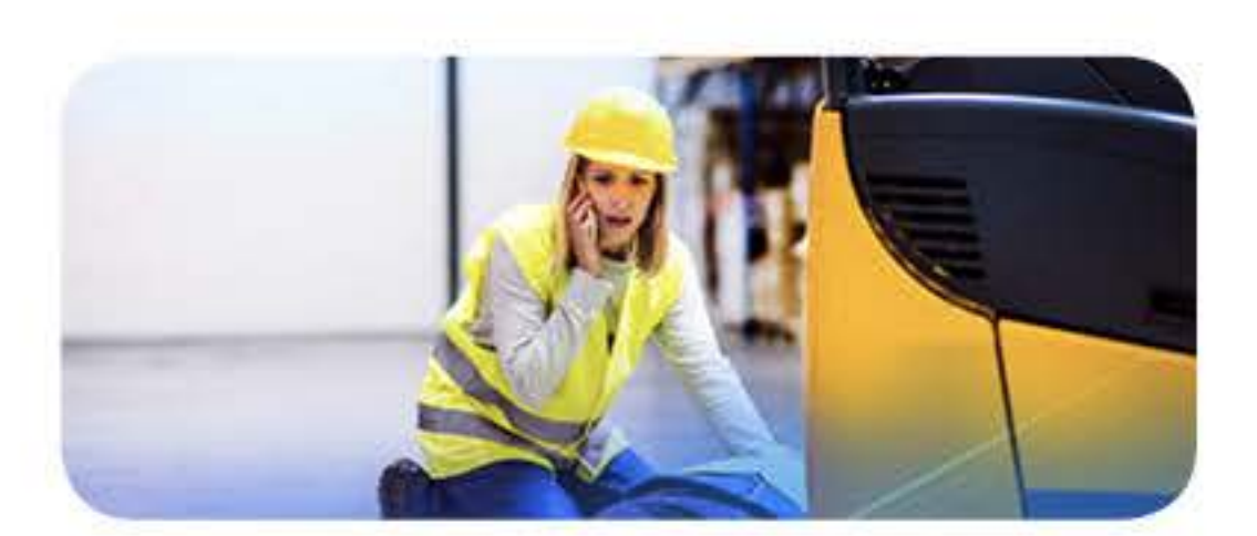
Prevention of pedestrian/vehicle collisions on industrial sites (Forklifts, nacelles, construction equipment)