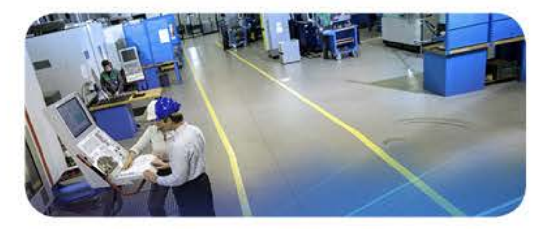
Sécurisation et délimitation des zones de dangers (Docks: loading / unloading area, dangerous intersections)