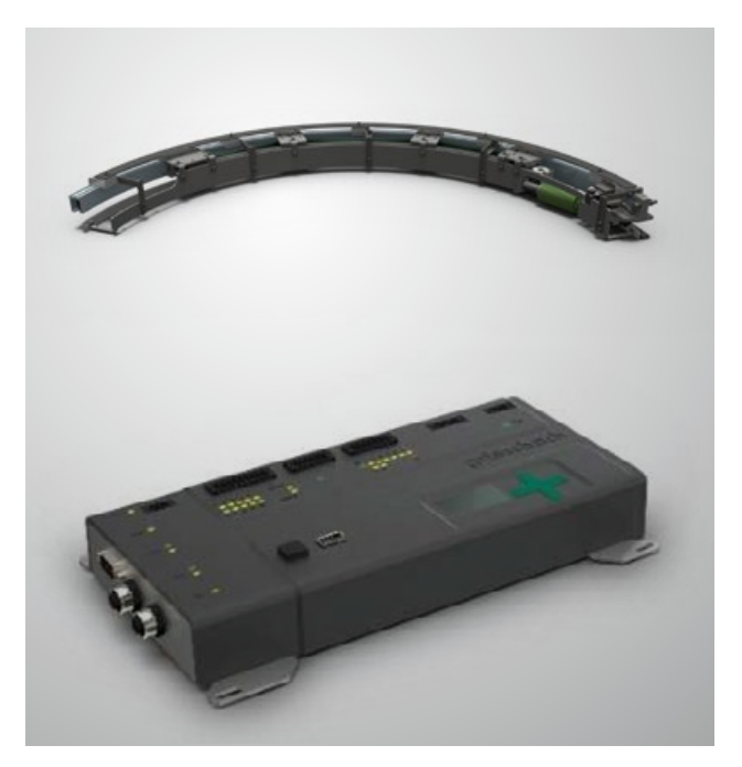
WC door drive and door controller