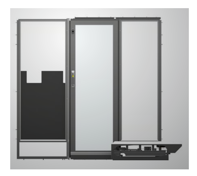
Partition with bottom drive