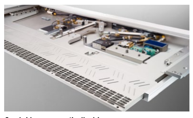
Gap bridge, pneumatically driven