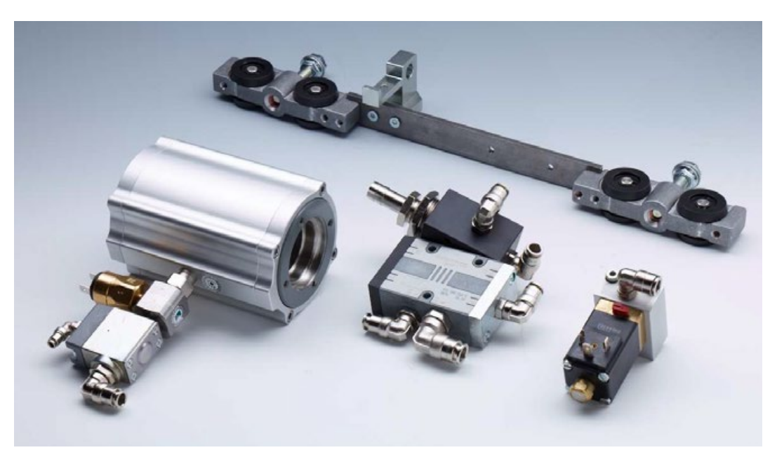
Spare parts for all products