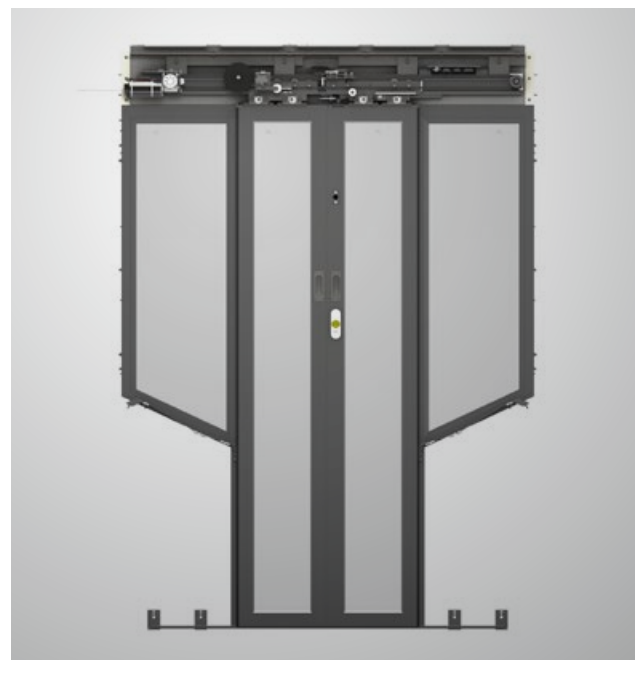
End door E20 / W20