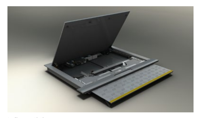
Infloor sliding step