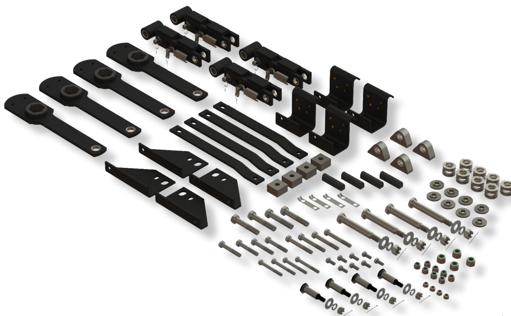
Example of PowerRail Truck Kit

them is one of the most important steps to staying on schedule. PowerRail offers a wide variety of custom kits for all your project needs. They work with their customers to define not only the contents of the kit, but also the timing of when it should arrive. The concept of creating customised kits first began with PowerRail building 92-Day and Annual Inspection Kits for their customers. The kits are assembled at PowerRail with all the necessary parts for the inspection... filters, lightbulbs, gaskets, etc., tagged with the customer's road number and shipped out based on their specific inspection schedule. The ease of ordering, the reduced inventory on customers' shelves, and the decrease in labor hours spent assembling kits onsite are all part of the value-added service that PowerRail provides. As the Inspection Kits became more popular,