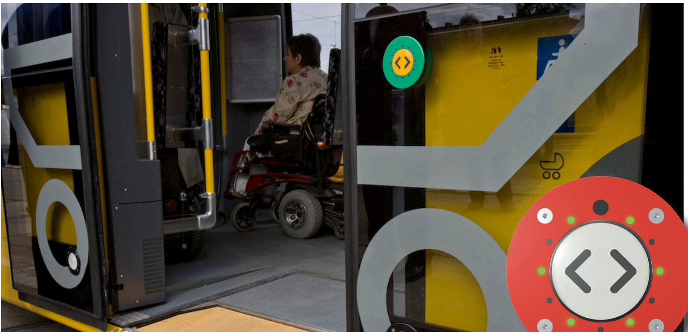
The CK push button has been used successfully for years in many vehicles worldwide (above). The new CK touchless version (right) for hygienic, touchless use will be presented at InnoTrans.

InnoTrans is the leading international trade fair for transport technology and after a break of four years due to Covid-19 TSL-ESCHA will show some new products and developments.