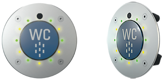
The new CK Touchless push button enables touchless operation through the integrated sensor above the tactile touch surface

Since November 2021, TSL-ESCHA has been part of the MAFELEC TEAM, an owner-managed French group. The CK Touchless is the first joint project between TSL-ESCHA and MAFELEC.