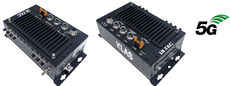
Figure: TRX R1 top and bottom views

Klas, in partnership with Adlink, solves these challenges with TRX R1 and the KlasOS Keel lightweight operating system. Furthermore, with Blackrock Ansible automation and monitoring platform from Klas, operators can easily maintain and secure TRX R1 gateways at scale.