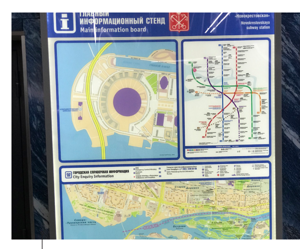
Metro Map & Directional Protection