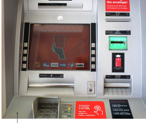
Bank Machine Protection